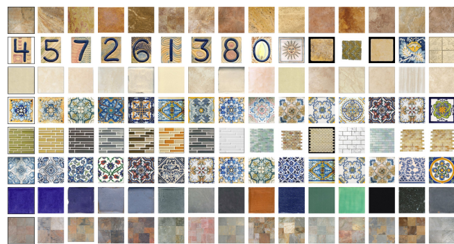
Figure 5. Examples of nearest neighbors for floor tiles.

Since one application of such systems is search, i.e., searching for an item that a user knows what it looks like (we assume that the user can answer queries as if she even knows what the store image looks like), it is natural to ask how well we have "honed in" on