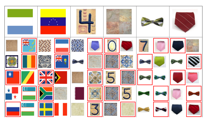
Figure 3. Six objects in the mixed dataset along with the adaptive pairs to which that object was compared, below, and user selections in red. The first pair below each large object was chosen adaptively based upon the results of ten random comparisons. Then, proceeding down, the pairs were chosen using the ten random comparisons plus the results of the earlier comparisons above.