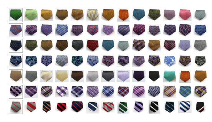
Figure 4. Nearest-neighbors for some neckties from the tiestore dataset. Nearest neighbors are displayed from left to right. Note that neck ties were never confused for bow ties, tie clips or scarves.

does not expect the adaptive algorithm to perform significantly better.