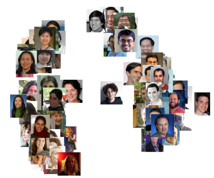
Figure 7. For fun: the faces of 186 colleagues displayed according to their projection on the top two principal components. The principal component is the horizontal axis.