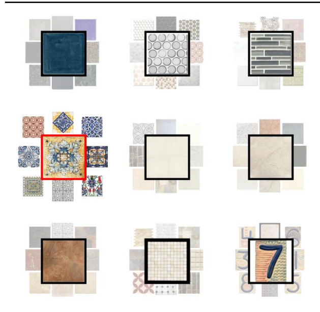
Figure 1. A sample top-level of a similarity search system that enables a user to search for objects by similarity. In this case, since the user clicked on the middle-left tile, she will "zoom-in" and be presented with similar tiles.

a more similar to b or to c," has a number of desirable properties over the classical approach employed in Multi-Dimensional Scaling (MDS), i.e., asking for a numerical estimate of "how similar is object a to b." These advantages include reducing fatigue on human subjects and alleviating the need to reconcile individuals' scales of similarity. The obvious drawback with the triplet based method, however, is the potential O(n^3) complexity. It is therefore expedient to seek methods of obtaining high quality approximations of K from as small a subset of human measurements as possible. Accordingly, the primary contribution of this paper is an efficient method for estimating K via an information theoretic adaptive sampling approach.