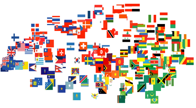
Figure 6. The flag images displayed according to their projection on the top two principal components of a PCA. The principal component is the horizontal axis.