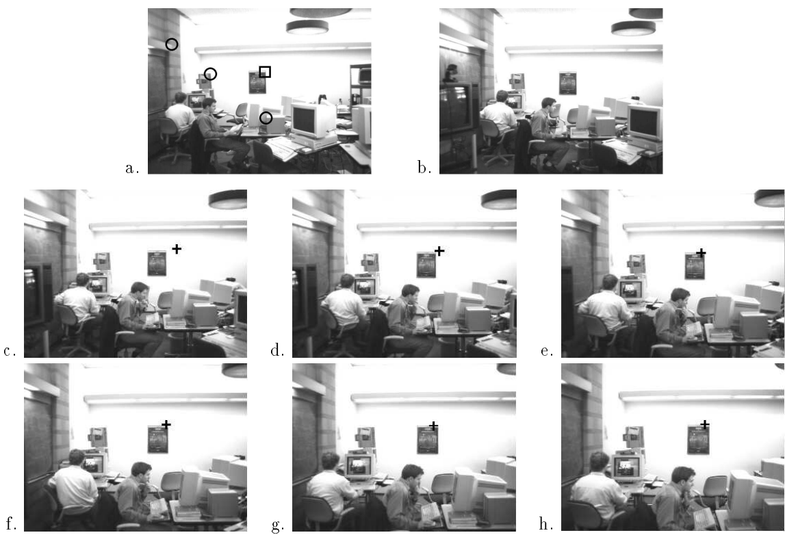
Figure 2. The location of four features (circles and box) are shown in the upper two "training" images. In the subsequent six images, the predicted location of one of the features is indicated by a cross.