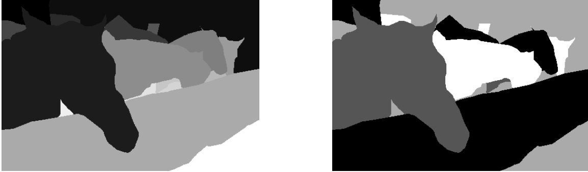
Fig. 1. A segmented image and its four colored version [6]

bitmap, we are not interested in finding just any coloring of the graph. We are interested in finding that k -coloring which will result in the most compressible k -colored bitmap. The entropy of the image is a measure of its compressibility. Hence the entropy of a graph coloring is defined as: